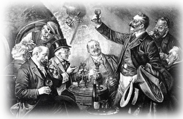
Barrister circa. 2026 - Friday afternoon around 18:00

This is your typical cab sauv – bold flavours of black currant & black cherry – this wine takes you back to cold nights in panelled clubs with rich friends, rich language and above all, rich food.