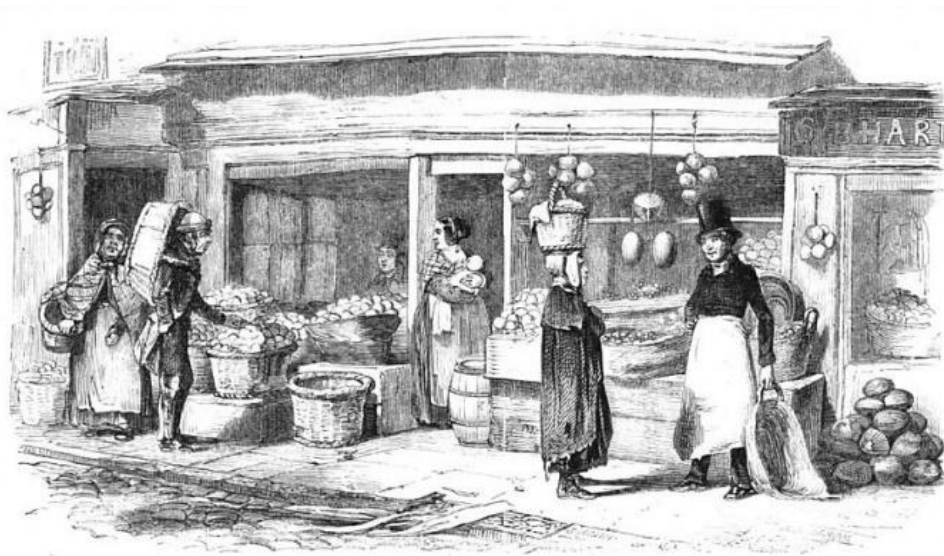
DUKE'S PLACE. — [From a Daguerrotype by BRASS.]