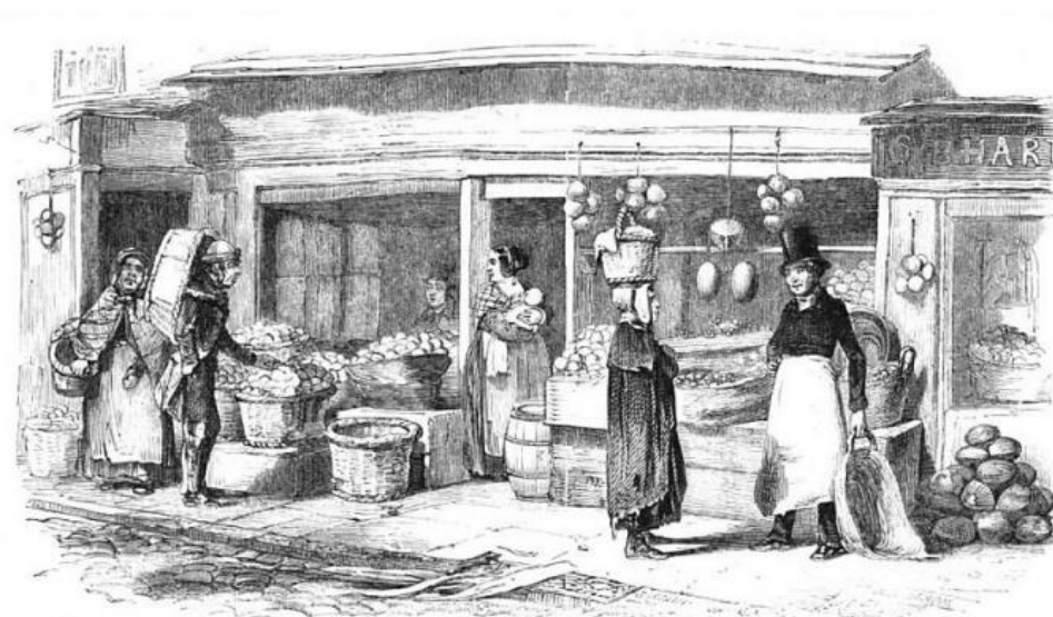
DUKE'S PLACE.